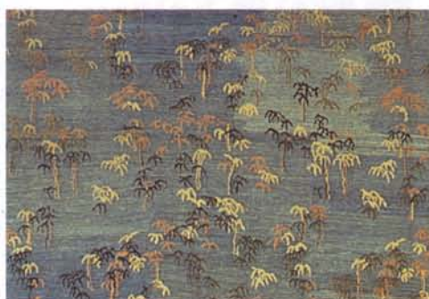
BAMBOO RUG MICHAELIAN AND KOHLBERG 212 431 9009