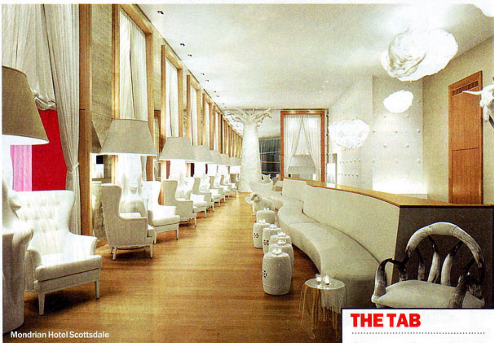
Mondrian Hotel Scottsdale

Those allergic to cowboy kitsch might feel a bit itchy at Roaring Fork (4800 N Scottsdale Rd, 480-947-0795), but the beef tenderloin with lip-smackin' green-chili mac and cheese justifies the visit. Plus, the Fork has one of the best bars in Arizona. Fishy folks, meanwhile, can ponder a mystery at posh but cozy Japanese eatery