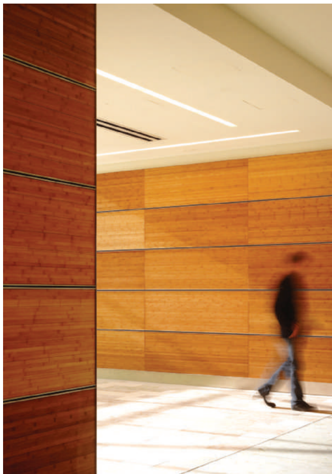
SOY BINDER A new adhesive increases the eco-cred of Plyboo's bamboo.

EVEN BEFORE LAST FALL'S Chinese drywall controversy made specifiers think twice about the material, architects and designers have been moving away from painted plasterboard walls—that ubiquitous trope of modern interiors—toward more decorative options like upholstery, wallpaper, leather, and tile. An attendant emphasis on budget consciousness, meanwhile, has spurred interest in surface treatments that multitask. Today's wall covering products need to work overtime, providing an aesthetic accent while enhancing acoustics, doubling as a writing surface, or improving indoor air quality like Smith & Fong's integration of a new bio-based adhesive in their bamboo (wall panels, shown right). —Jen Renzi